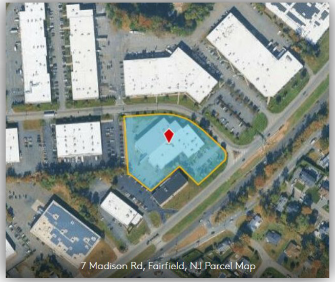
7 Madison Rd, Fairfield, NJ Parcel Map