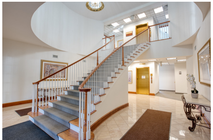
Front entrance foyer

Comments: First Floor Turnkey Medical space available. The building is located close to Route 80 and Route 46, including a full building backup generator.